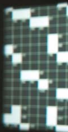
Kerry Tribe, H.M. , 2009, Double projection of a single 16mm film.