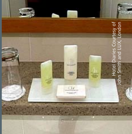
Hotel Diaries