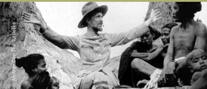
Mother Dao The Turtlelike

All profits from these events will be donated to The Cube's Haiti Kino Kids Project.