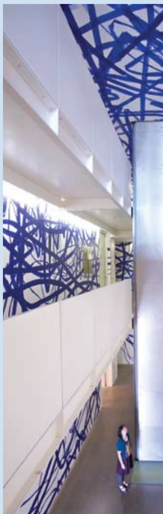
Otto Zitko; Me, Myself and I, Arnolfini Installation View, Photo: Carl Newland