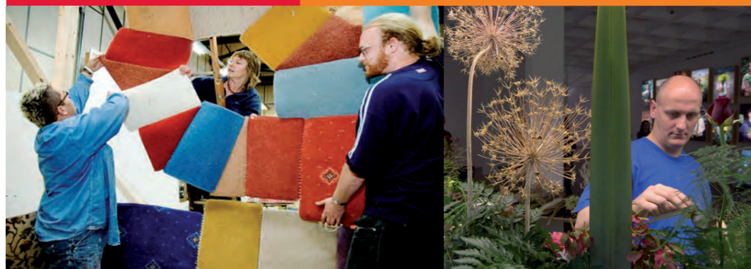
Dream Digester being made at Studio Upstairs

Although diverse in outcome, each project explores new ways in which people can be part of the life and art of Arnolfini.