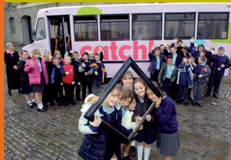
Our Lady of the Rosary arrive at Arnolfini on the Catch! bus