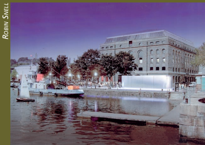
How the quayside might look