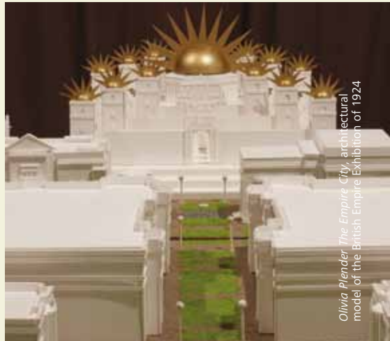
Olivia Plender, The Empire City, architectural model of the British Empire Exhibition of 1924