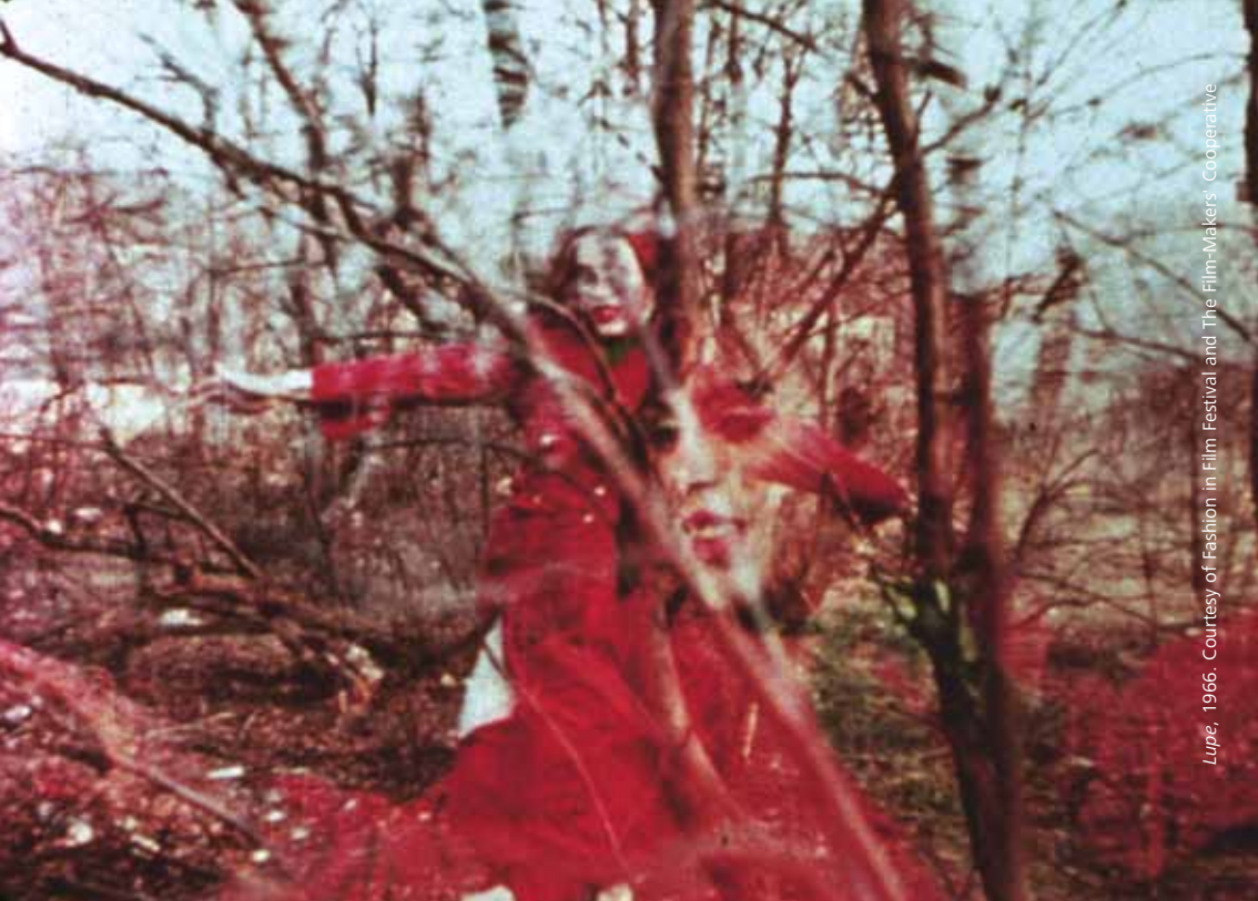
Lupe, 1966.

at Arnolfini, and provides a rare glimpse into the exquisite European melodramas of the silent era.