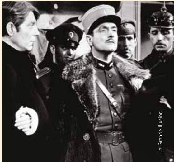
La Grande Illusion