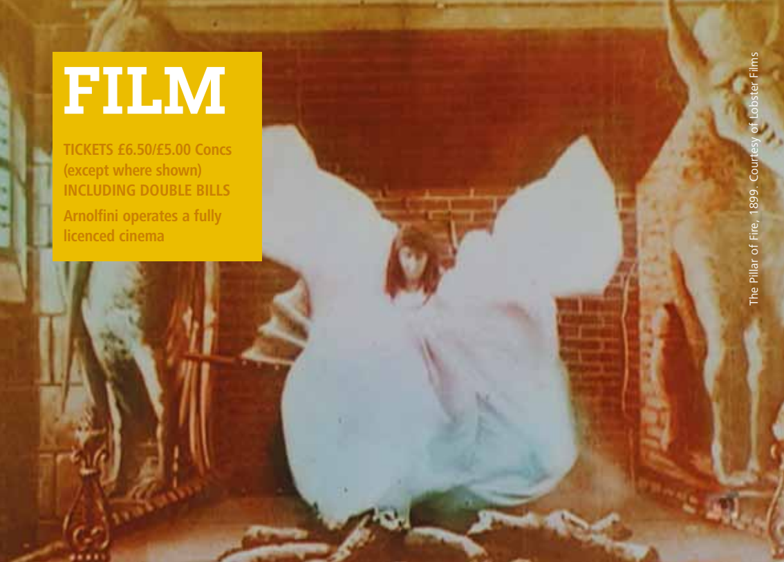
The Pillar of Fire, 1899.

TICKETS £6.50/£5.00 Concs (except where shown) INCLUDING DOUBLE BILLS Arnolfini operates a fully licensed cinema