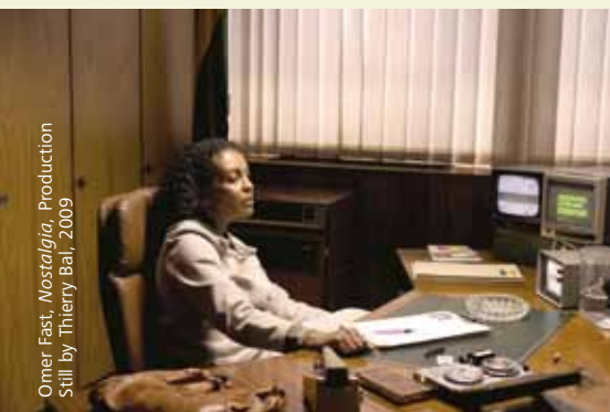
Omer Fast, Nostalgie , Production Still by Thierry Bal, 2009

This discussion event with exhibiting artists and moderated by the exhibition curators, will consider the different reasons and methodologies employed by artists, and discuss what exactly the science fiction genre offers to the debate about representations of Africa.