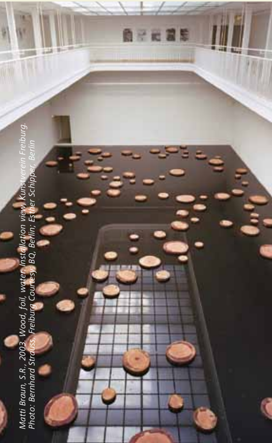
Matti Braun, S.R., 2003. Wood, foil, water, installation view, Kunstverein, Freiburg.